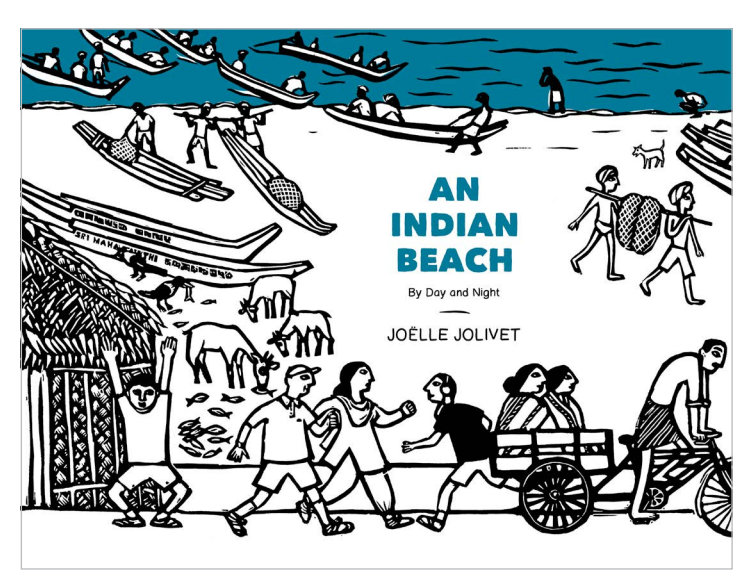
illustration: JOËLLE JOLIVET

A walk down the beach can be sensory delight – the hues of the sun and the water, the saltiness in the air, the tingling sensation of sand against the foot, the sound of crashing waves. It is also a great place for people watching. An Indian beach has more to offer – including fishing boats, the merry-go- round, food stalls and much more.